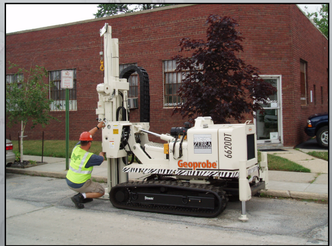
ZEBRA Geoprobe 7720